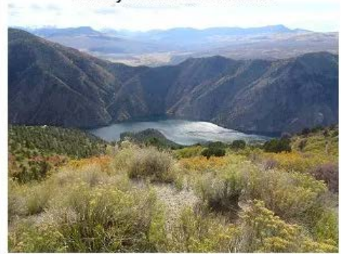
Black Canyon of the Gunnison