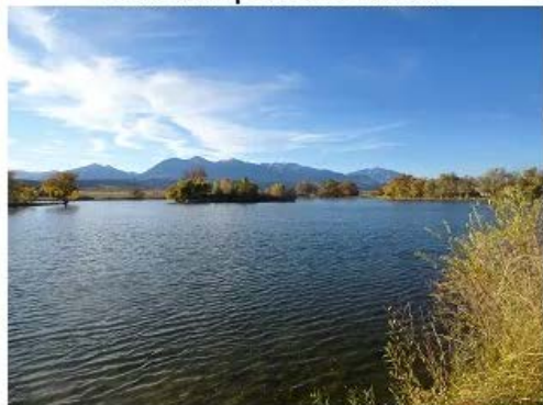
Lakes and Mountains of Colorado