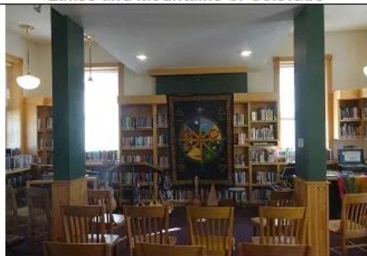
Concert Set up @ Crested Butte Library