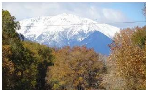
Snowy Peaks in Colorado