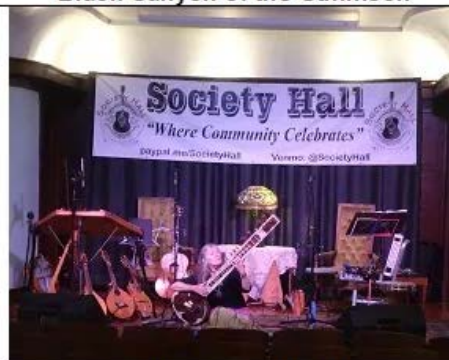
Society Hall Concert, Alamosa