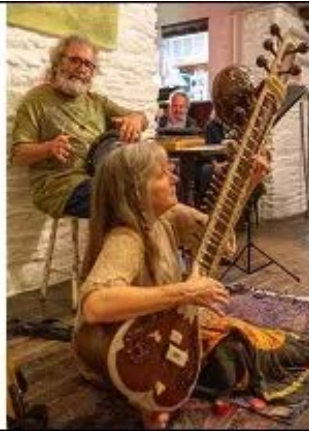
Raga on the Sitar