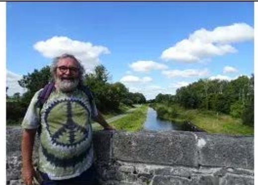
And walks on the Royal Canal