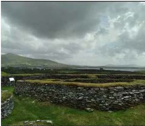
Leacanabuaile Stone Fort