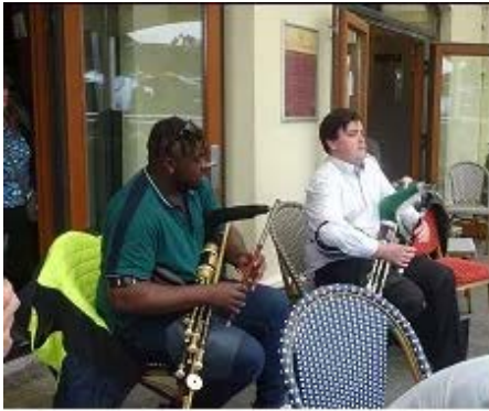
Piper's giving a demonstration