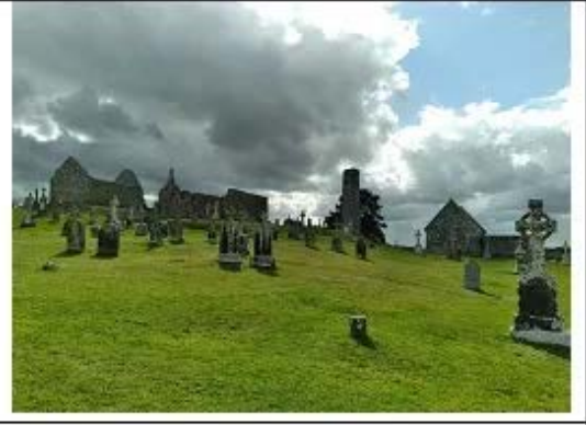
Clonmacnoise- churches, high crosses

OTHER ARCHAEOLOGY & SITES: We also visited the Corlea Trackway, an Iron Age roadway, made of oak planks dating back to 148–147 BC, which was found submerged in the bog and which linked together several important ancient sites including The Hill of Tara, Uisneach and Rathcroghan. In addition, we toured Strokestown Famine museum, Boyle Abbey, and Rathcroghan where we went crawling down into Oweynagat Cave. We even took a river cruise from Athlone up the River Shannon to Lough Ree.