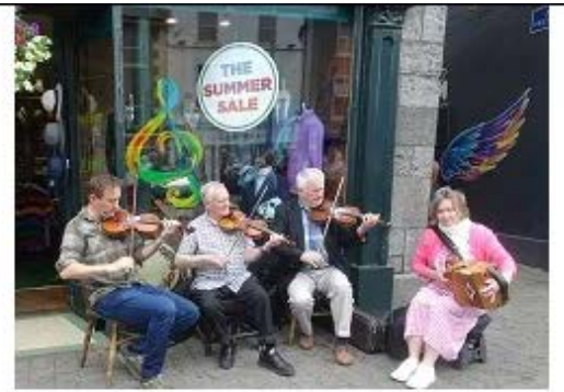
Great music on the streets