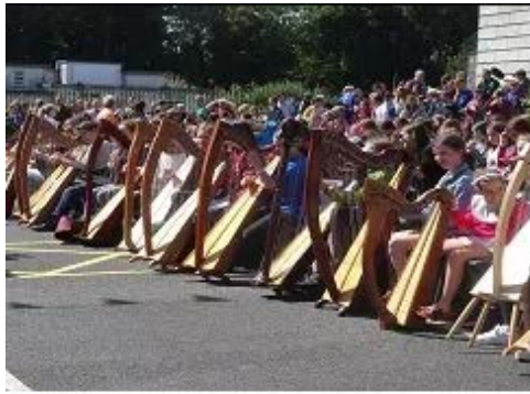
Harpers at the Fleadh Ceoil

Fleadh Cheoil na hÉireann- Ireland's largest traditional music festival: We attended the Fleadh in Mullingar, Co. Westmeath, in early August. It was truly an amazing experience and we are definitely joining in next year. There were musicians & dancers everywhere on the streets, demonstrations, outdoor and indoor concerts, competitions and great weather!!