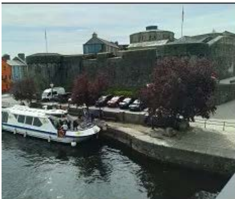
River Cruise on the Shannon