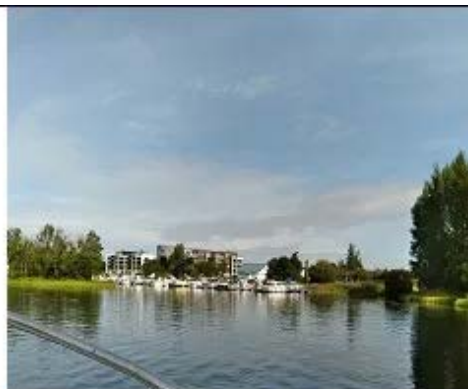
Lough Ree Cruise