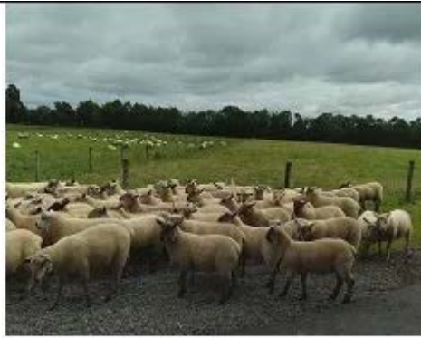
There were loads of Sheep