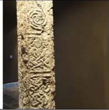
Carvings on High Cross