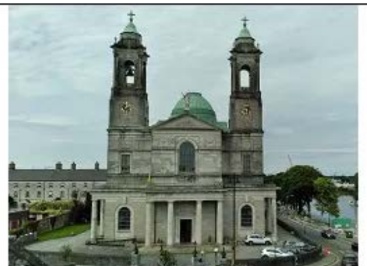
St. Peter & Paul's Church, Athlone