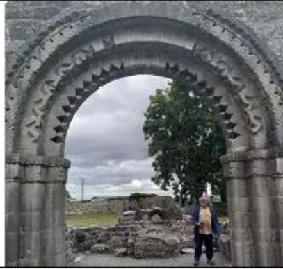
The Nun's Chapel