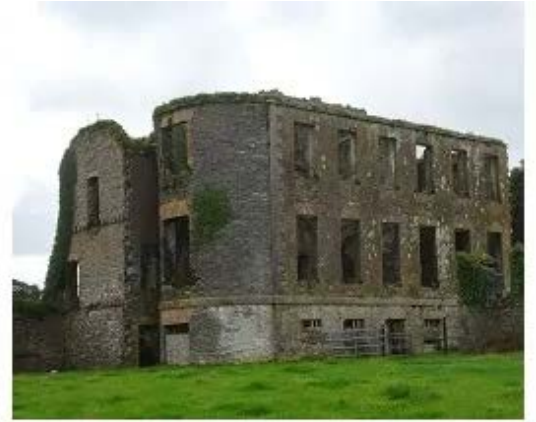
Bagha Famine Era Workhouse