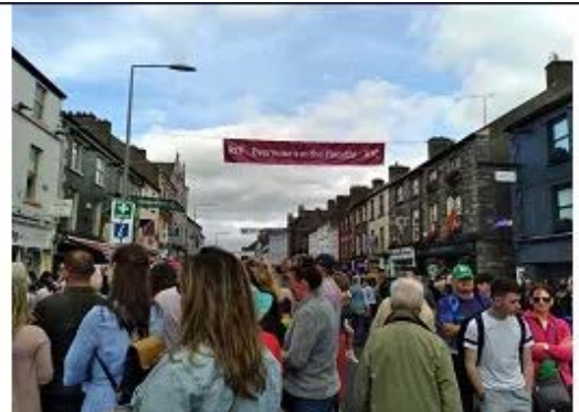
Loads of people attended