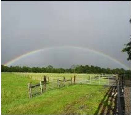
Rainbow @ the Farm

COUNTY LONGFORD AND THE ROYAL CANAL: We stayed on a farm in August in County Longford and walked along the Royal Canal many times every week where we saw boats going through the Locks and many butterflies and dragonflies.