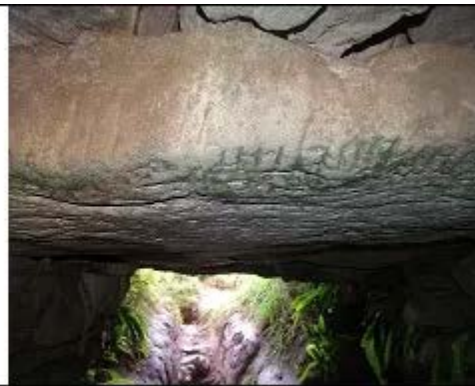
Ogham Stone @Oweynagat Cave