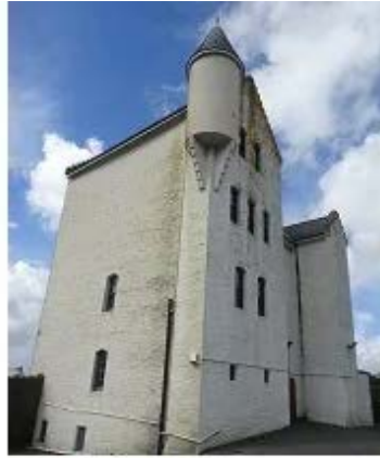
Old Barracks – Cahersiveen