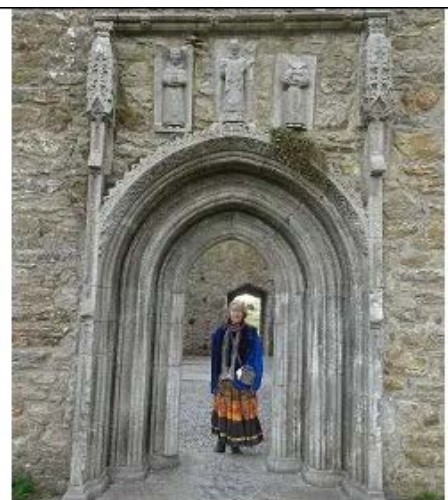
The Whispering Arch