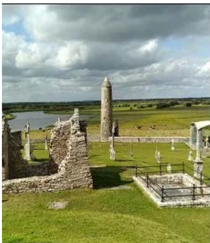
Round Tower & Ruins

CLONMACNOISE MONASTIC SETTLEMENT: We visited the 6th Century Monastic settlement of Clonmacnoise, founded along the River Shannon by St. Ciaran.