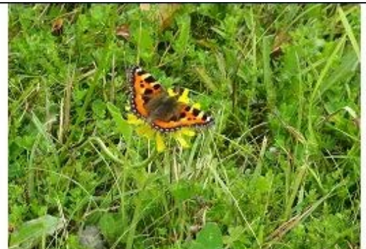
Small Tortoiseshell Butterfly

CLONMACNOISE MONASTIC SETTLEMENT: We visited the 6th Century Monastic settlement of Clonmacnoise, founded along the River Shannon by St. Ciaran.