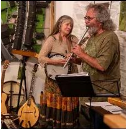
Oasis Arts Café concert

https://www.youtube.com/watch?v=QRJ6AUkQtFQ&authuser=0