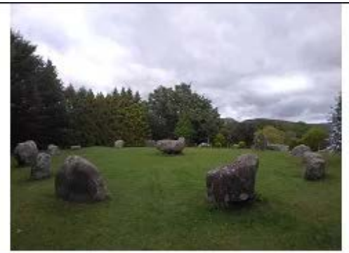
Kenmare Stone Circle

2023 IRISH BUS TOURS: We announced our 2023 Ireland Bus Tours in a separate email this week. If you did not receive the Announcement, please email us and we will forward it to you. fourshillingsshort@gmail.com