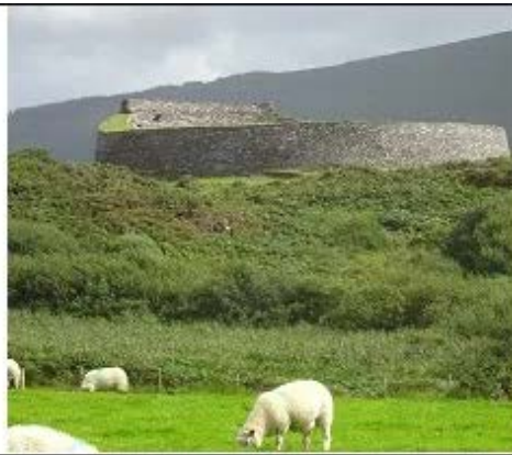
Cahergal Stone Fort