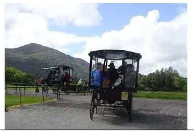
Jaunting Cars at Killarney National Park

(Day 4 – 6: May 16 - 18) Next we traveled south to County Kerry, where we stopped for the afternoon at Killarney National Park to tour the Muckross House and Gardens. Most of the tour group took a horse drawn jaunting car around the Lakes of Killarney. The Rhododendron's and Bluebells were everywhere at the park and the walks along the extensive gardens and forest were very relaxing. We ended the day in the music town of Dingle and the views from our hotel of Dingle Bay were breathtaking.