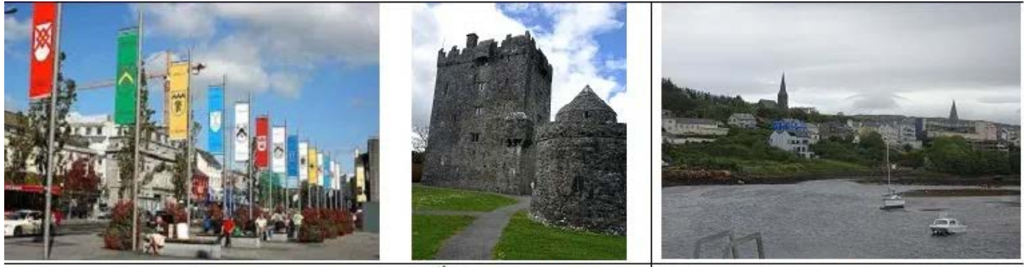
Eyre Square - Galway City

(Day 7 – 9: May 19 - 21) After three wonderful days in County Kerry, we then traveled north to County Galway. We spent the afternoon in Galway City and then on to Aughnanure Castle before ending the day in Clifden, The Capitol of Connemara. The following day, many of our group went to the Connemara National Park and some even hiked up "The Diamond", while others went to the Connemara Heritage Center which takes you on a trolley up into the high hills to learn about cutting "Turf" and visit a restored "Famine" cottage.