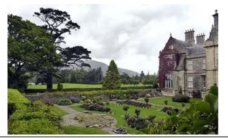
Muckross House & Gardens