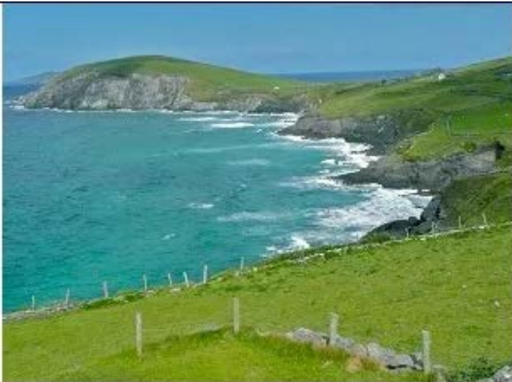
Coumeenole Beach & Dunmore Head