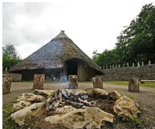
Craggaunowen Megalithic Park

On day 3 , we will visit the Cliffs of Moher, Black Head, the Burren, Caherconnell Ring Fort and Poul-nabroune Dolmen. We then return to Ennis and have a free evening to enjoy dinner at one of the many fine restaurants in town and to hear live traditional music.