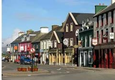
Dingle Town, County Kerry