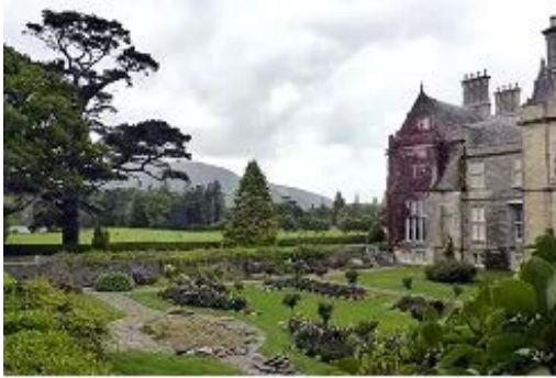
Muckross House & Gardens

(Day 4 – 6: May 16 - 18) On day 4, we travel south to County Kerry, stopping at Killarney National Park to tour the Muckross House and Gardens. There one can also ride a horse drawn jaunting car around the Lakes of Killarney, hike to Torc Waterfall and walk among the lakes and acres of forest. We end the day in the music town of Dingle where we'll have our 2nd group meal together and stay for 3 nights at the Dingle Skellig Hotel which overlooks Dingle Bay