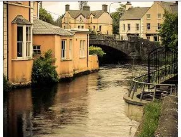
Ennis, Co Clare