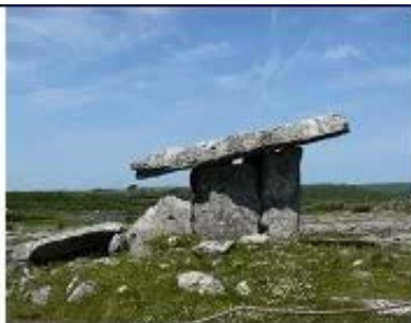
Poul-nabroune Dolmen and The Burren