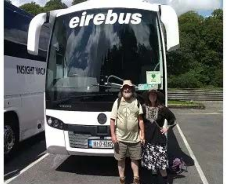
Eirebus Coach & your Tour Guides

(Day 1 – 3: May 13 – 15) The West Coast tour begins in Shannon, County Clare. We meet each tour member when they arrive at Shannon Airport and transport them to the famous music town of Ennis, County Clare where we'll be staying at the Temple Gate Hotel, which was once a Convent and was converted into a beautiful hotel located in the center of Ennis.