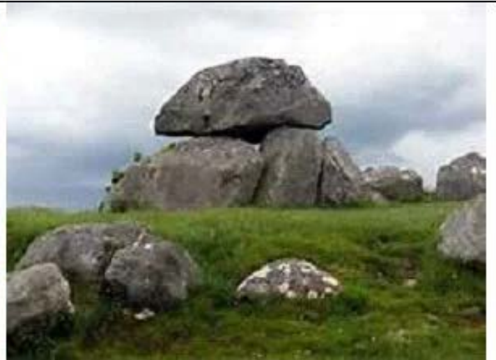
Carrowmore Megalithic Complex

(Day 13: May 25) On our last full day of the tour, we travel from Sligo back to Shannon stopping along the way at Coole Park, home of Lady Gregory who, along with W.B. Yeats, founded the Abbey Theatre in Dublin and who was part of the Irish Literary Revival of the 20th Century. Coole Park has lovely walks, a museum, a teahouse and gardens. We end the day at the Shannon Springs Hotel and have an Irish Music Session after dinner in the Shannon Springs Hotel pub.