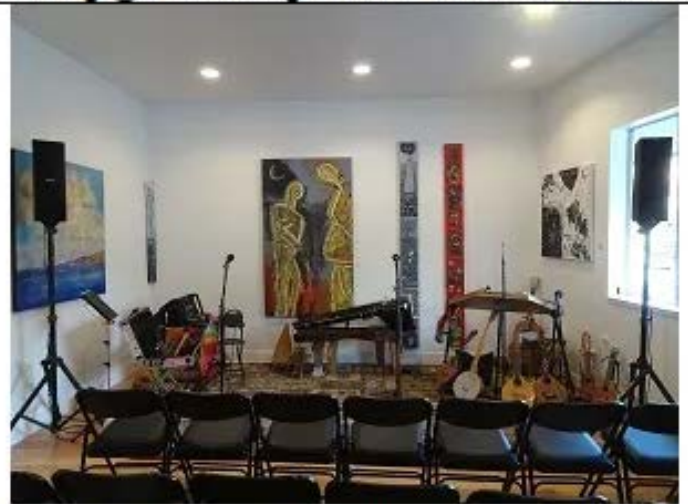
Benefit Concert @ Oli Gallery: Guerneville, CA

Back home on the Emerald Isle: We returned to Ireland on Wednesday, April 27th and are getting our feet firmly planted on the beautiful green shores of Eire. Our upcoming West Coast Tour begins on May 13th and we have 32 lucky friends who will be joining us. Below is a brief description of our upcoming tour along with some photos for you to enjoy. We're hoping to lead 2-3 tours in 2023.