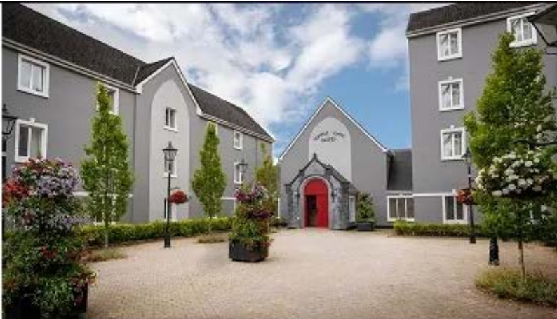
Temple Gate Hotel

(Day 1 – 3: May 13 – 15) The West Coast tour begins in Shannon, County Clare. We meet each tour member when they arrive at Shannon Airport and transport them to the famous music town of Ennis, County Clare where we'll be staying at the Temple Gate Hotel, which was once a Convent and was converted into a beautiful hotel located in the center of Ennis.