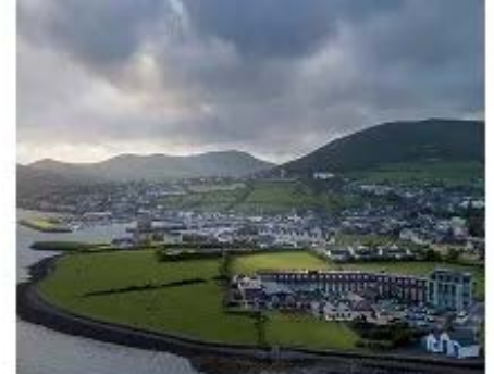
Dingle Skellig Hotel