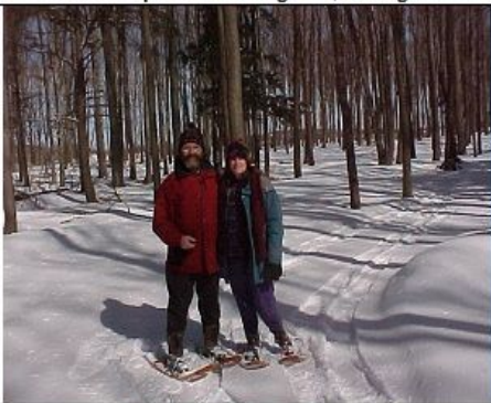
Snowshoeing in Wisconsin