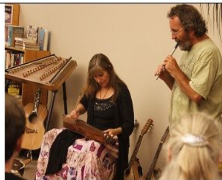
Live music is magic!!