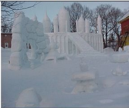
Ice Sculptures in Houghton, Michigan

This will be our first "virtual concert" and we hope that you will be able to tune in.