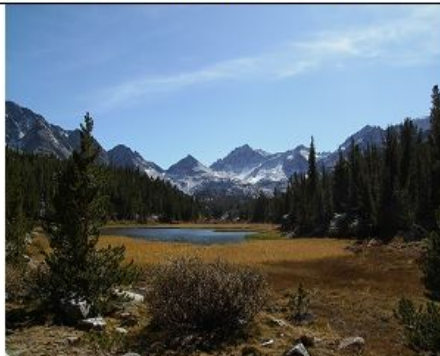
Rocky Mountain peaks