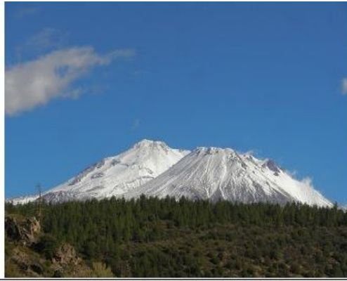
Snow covered extinct volcano

November or Samhain, as it is called in Irish, marks the beginning of Winter.