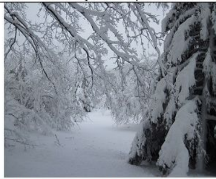
Winter wonderland in Michigan