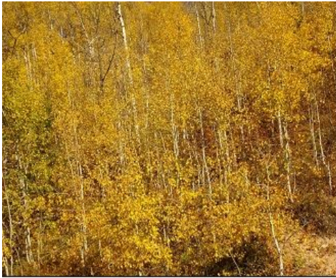
Golden Aspens of Autumn