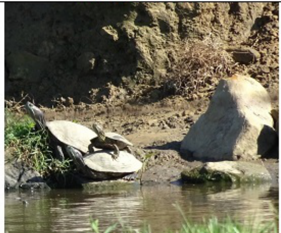
Painted Turtle Family