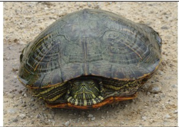
Ornate Box Turtle