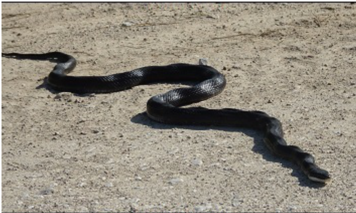
Black Rat Snake