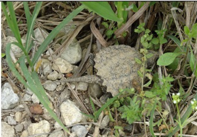
Baby Snapping Turtle