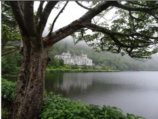
Kylemore Abbey, County Galway, Ireland