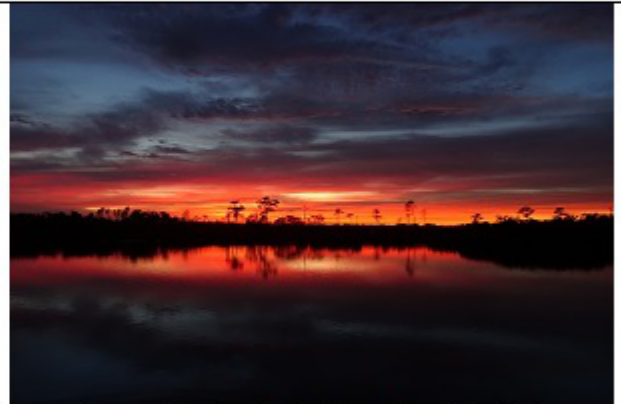
Sunset on St. Sebastian River, Florida