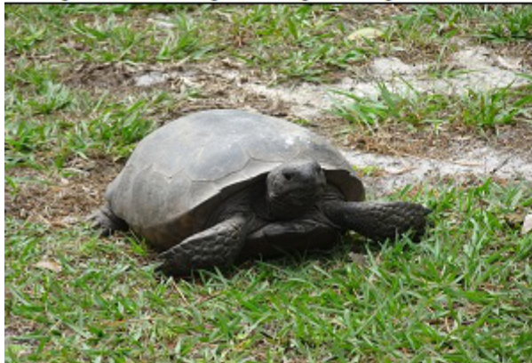
Gopher Tortoise, Sebastian, Florida