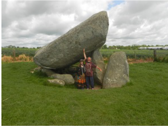
Brownshill Dolmen, County Carlow, Ireland

February has flown by and the month of March is upon us, which means it is time to get ready for St. Patrick's Day. Our "Celebration of Ireland" concert includes music, poetry, stories and folklore of Ireland.