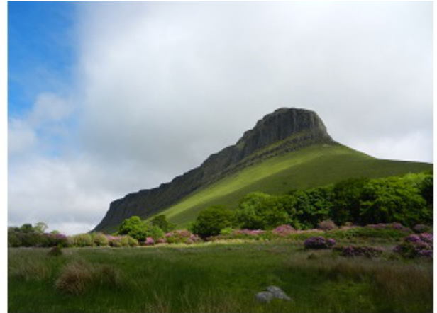
Benbulbin, County Sligo, Ireland